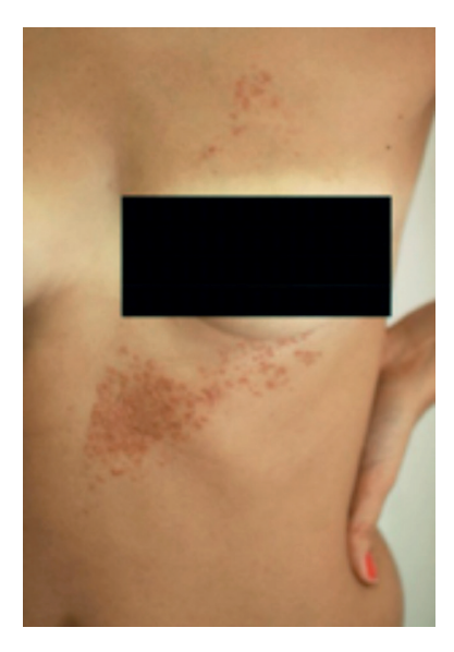
Figure 5. Pink millimetric papules with a fine scale starting from above and under the left breast (middle line), and extending to the back

however, recurrence occurred with the termination of the treatment. Five patients with severe and diffuse Darier's disease were started on acitretin treatment, and there was a good response to treatment in 80% of these patients.