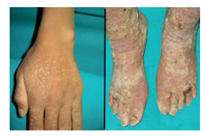
Figure 2. Acrokeratosis verruciformis-like lesions on the back of the hand and hyperkeratosis on the dorsum of the feet

seborrheic areas. In patients in the current study, the head and neck, trunk, extremities, and flexural areas were affected (Figure 1). Hand involvement is common, and it was present in 4 patients in this series, of whom 3 had acrokeratosis verruciformis-like lesions on the back of the hand and 1 had palmoplantar keratoderma (Figure 2). In addition, we observed keratotic erythematous brown crusted verrucous papules and hypertrophic plaques. In one of the patients, more than 80% of the body was involved, and the disease manifestation was severe with verrucous plaques, intense desquamation and fissures in the face and extremities (Figure 3). One of the patients had a predominantly flexural involvement and minimal involvement in other areas (Figure 4). In one case, there were keratotic papules in a linear fashion following the lines of Blaschko (Figure 5) (Table 1). In all cases, the symptoms flared up during the summer months, under hot and humid conditions, and after mechanical trauma. Seven patients complained of itching.