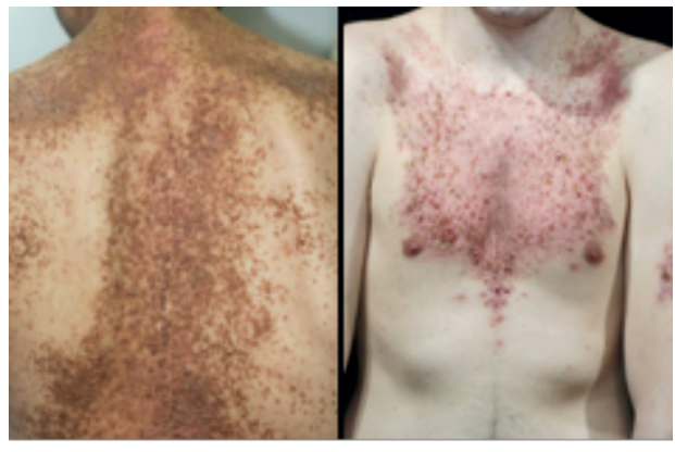
Figure 1. Keratotic papules, erythematous papules and brown crusted papules over seborrhoeic areas

The case series comprised nine patients (6 male and 3 female) aged between 11 and 67 years (mean age: 32.5 years). The age of onset of the disease ranged from 8 to 47 years with a mean of 19.7. Two patients were from the same family (mother and child), whereas the remaining 7 cases did not have a family history of Darier's disease. In Darier's disease, cutaneous lesions are initially observed over