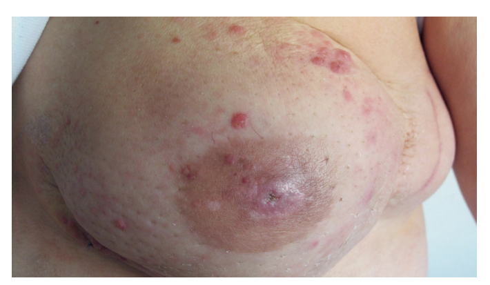
Figure 1. Individual and grouped pink-red nodules over the breast