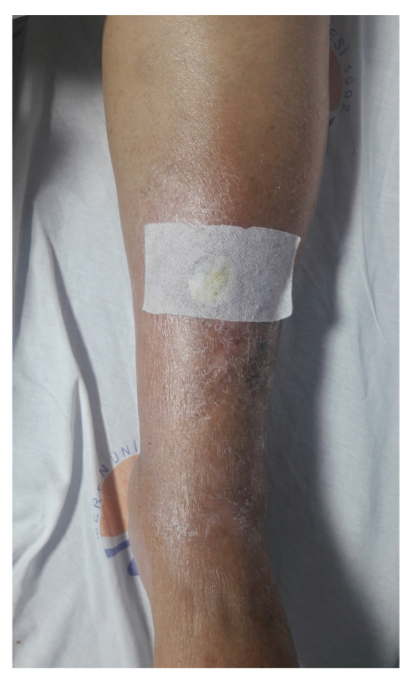
Figure 4. An ulcer emerged after regression of the tumor on upper part of leg. Other tumors healed with postlesional hyperpigmentation