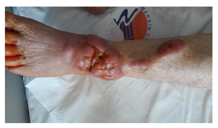
Figure 1. Three erythematous tumoral lesions on the anterior aspect of her leftleg. The largest nodule was 7 cm in diameter and had an ulcer on top

ankle and extends to the dorsal foot. There are also smaller 2 nodules on the anterior aspect of her left lower leg that are 2 cm and 3, 5 cm in diameter. Constitutional symptoms such as, fever, night sweats, pruritus or weight loss was absent. Neither hepatosplenomegaly nor lymphadenopathy was detected in physical examination. All laboratory tests were negative, including a full blood count, biochemistry, routine urine examination, except hemoglobin (hemoglobin 11.2 g/dL, normal range: 11.7-16.1 g/dL) and creatinine levels (creatinine 1.89 mg/ dL, normal range: 0.5-0.9 mg/dL). Serology tests for viruses (human immunodeficiency virus and hepatitis B and C viruses) were negative, except anti HBS-105.7 positive and anti immunoglobulin G (HBC IgG)-0.012 positive. In magnetic resonance imaging of the left lower leg, the tumor was found to extend to bone tissue, without bone infiltration. Histopathological sections showed superficial and deep dermal infiltration of atypical lymphoid cells with extensive irregular nuclear contour, partially vesicular nucleus, prominent nucleoli, narrow eosinophilic cytoplasm and frequent mitosis, causing focal ulceration in the epidermis (Figure 2). Immunohistochemically, these cells showed diffuse cytoplasmic staining with CD20 (Figure 3), BCL2. T lymphocyte markers were very sparse. The Ki67 proliferation index was detected as 70%.