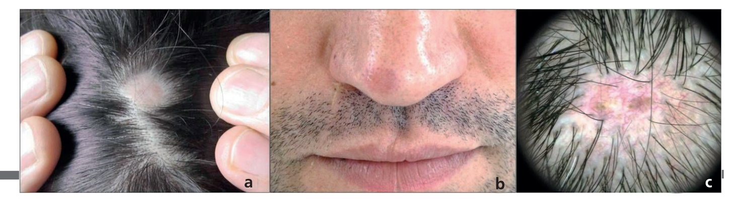
Figure 1. Hair loss on scalp, erythematous patch on nose (a, b). Dermoscopy shows the absence of follicular ostia, orange spot, thin hairs, and linear arborising vessels (c)