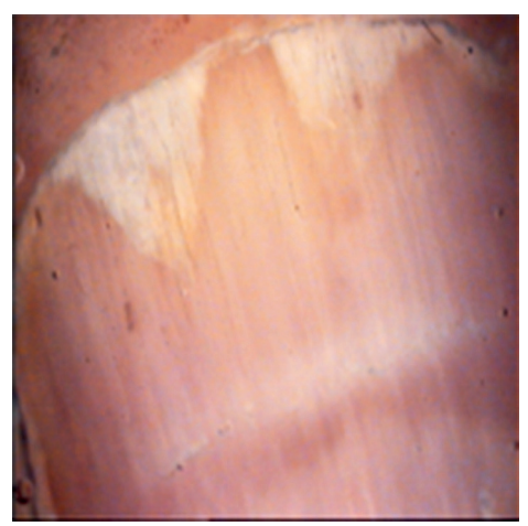
Figure 2. Erythematous border around the onycholytic area, Beau's lines, splinter haemorrhage

Pitting refers to superficial, punctate depressions on the dorsal area of the nail plate which occur due to parakeratosis in the proximal nail matrix. It is deeper and abundant with different sizes in psoriasis compared to that in other disorders. The most common finding observed in studies by Kaur et al.<sup>7</sup>, Tham et al.<sup>8</sup> and Reich<sup>9</sup> was pitting (73%, 68%, and 75.3% respectively). Consistent with the literature, we also determined pitting as the most common finding in clinical examination (92.5%).