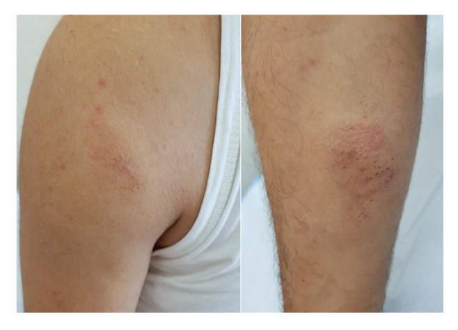
Figure 1. Erythematous, follicular and comedonal plaques on extremitites

A total 117 patients diagnosed with MF clinically and histopathologically were included in the study. Sixty-four of the patients were female (54%) and 53 were male (46%). The mean age at diagnosis was 55.6±16.03 years (range: 20-89 years). The mean disease duration was 5.6 years. Sixty-one patients (52%.1) had stage IA, 20 patients (17%) had stage IB, 31 patients (26.4%) had stage IIA, 3 patients (2.5 %) had IIB stage, 1 patient (0.85%) had IIIB stage and 1 patient (0.85%) had IVA stage of the disease. Atypical forms of the disease were detected in 6 (5.1%) patients. Three (2.5%) of these cases were follicular MF, one patient for each types of hypopigmented, ichthyosiform and granulomatous MF (Figures 1-4). Demographic and clinical features of all patients are shown in Table 1, and atypical forms are shown in detail in Table 2. All patients were treated with medium-potent topical corticosteroids. Additionally 99 (84.6%) patients received phototherapy, 20 patients (17%) acitretin, 6 patients (5.1%) topical bexarotene, 4 patients (3.4%) methotrexate and 1 patient (0.85%) systemic interferon treatment. Of the patients who received phototherapy 30 had Psoralen Ultraviolet A (PUVA), 46 had narrow band UVB (nb-UVB) and 12 had both PUVA and nb-UVB during follow-up. Acitretin was added to 13 of the patients who received phototherapy, 9 patients had acitretin with PUVA, 7 patients had acitretin with nb-UVB, and 3 had both UVB and UVA treatment with acitretin during follow-up.