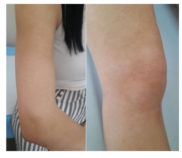
Figure 4. Hypopigmented patches on extremities