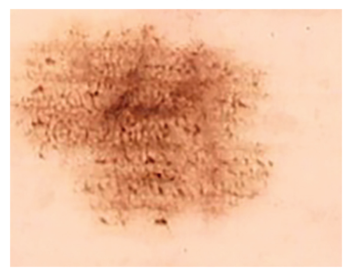
Figure 3. Parallel furrow pattern (dotted-line variant) (Fotofinder dermoscope imaging system, orginal magnification: X20)

pattern has been observed most frequently in 16-30 age group. No significant difference has been determined in pattern distribution of volar and dorsal groups in terms of age group.