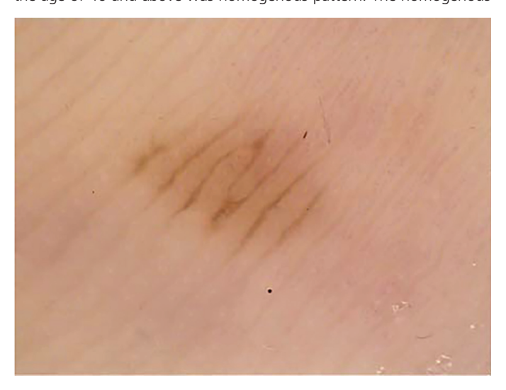
Figure 1. Parallel furrow pattern (single lined variant) (Fotofinder dermoscope imaging system, orginal magnification: X20)

When evaluating the dermoscopic pattern distribution in dorsal lesions in terms of age group, the most frequent pattern observed at the age of 45 and below was reticular pattern. The most frequent pattern at the age of 46 and above was homogenous pattern. The homogenous