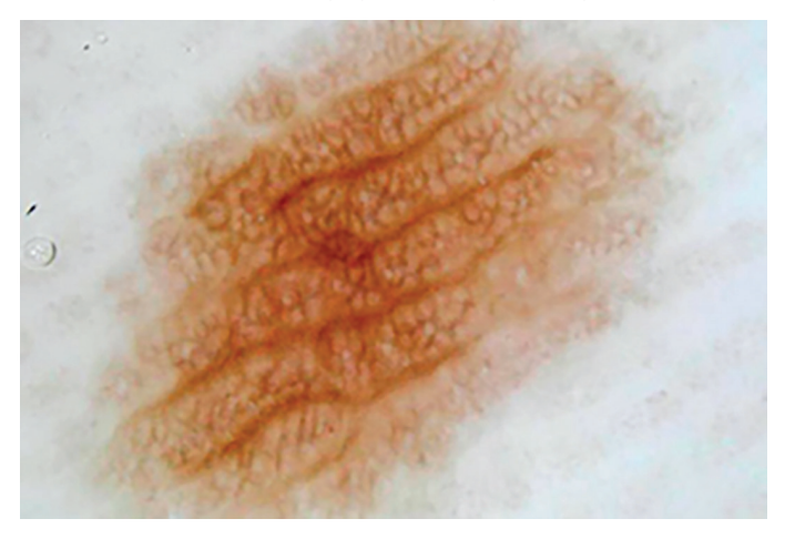
Figure 4. Parallel furrow pattern (network variant) (Fotofinder dermoscope imaging system, orginal magnification: X20)