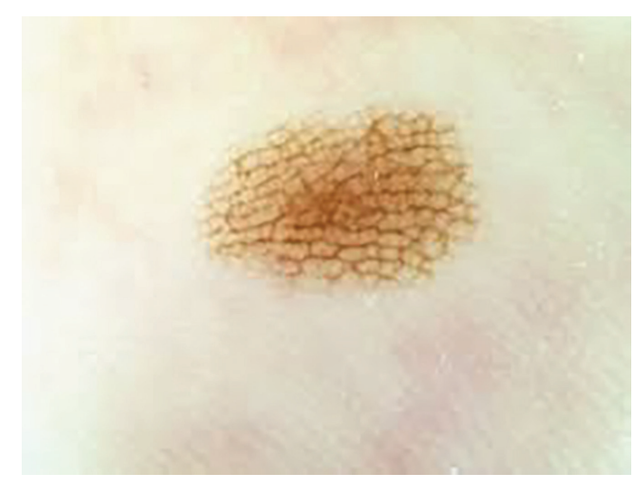
Figure 2. Reticular pattern (Fotofinder dermoscope imaging system, orginal magnification: X20)

pattern has been observed most frequently in 16-30 age group. No significant difference has been determined in pattern distribution of volar and dorsal groups in terms of age group.