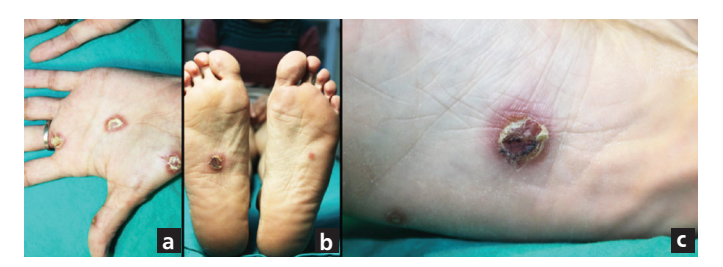
Figure 1. a-c) Diffuse yellowish hyperkeratotic plagues on the palms and soles