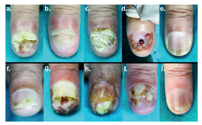
Figure 1. a) Clinical appearance of patient on admission. b) Partial improvement of one week of topical beclomethasone dipropionate and topical bacitracin and neomycin sulfate ointment. c) Disease recurrence after three weeks of alternate-day administration of topical beclomethasone dipropionate. d) Nail bed punch biopsy was performed. e) Complete nail regrowth with linear ridging, minimal discoloration, punctuate leukonychia, and minimal distal onycholysis at the end of the 14 weeks of once-weekly topical tacrolimus 0.1% ointment therapy regimen. f) Clinical picture of the beginning of recurrence during the 21. week of once-weekly therapy regimen. g) The lesion was deteriorated despite the occlusive applied topical tacrolimus 0.1% ointment. h) Intralesional corticosteroid injection plus topical antibiotics was failed and nail plate was avulsed. i) There was no response to topical tacrolimus which was restarted after intralesional corticosteroid injection. j) Considerable clinical response was achieved with the treatment of 0.005% calcipotriol plus 0.05% betamethasone dipropionate ointment

A 44-year-old female patient presented with a 4-year history of recurrent periungual inflammation and left toenail disfigurement. The lesions had started as yellowish suppuration on the periungual region and extended under the nail plate. There had previously been no clinical response to systemic amoxicilline and clavulanic acid, topical clotrimazol, and mupirocine treatments. Dermatological examination revealed periungual erythema, edema, partial loss of nail plate, subungual lakes of pustule, and yellowish crusts on the nail bed (Figure 1a). All other fingers and toenails were normal and she was free of arthralgia. There were no notable findings from her physical and laboratory examinations. Fungal elements were not detected on the potassium hydroxide (KOH) preparation, and a hand X-ray showed no bony or articular abnormalities. With prediagnosis of ACH, topical beclomethasone dipropionate 0.025% in combination with topical bacitracin and neomycin sulfate ointment was commenced; one week later, partial improvement was observed (Figure 1b). Topical antibiotherapy was stopped, and topical corticosteroid was continued every other day. Under this therapy regimen, recurrence was observed three weeks later (Figure 1c). In this instance, histopathologic