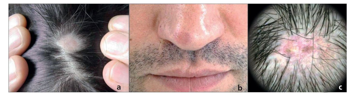
Figure 1. Hair loss on scalp, erythematous patch on nose (a, b). Dermoscopy shows the absence of follicular ostia, oranges spot, thin hairs, and linear arborising vessels (c)