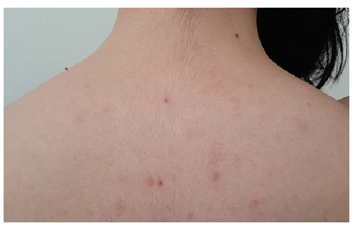
Figure 3. Mild atrophic scars on the upper back

The cases of regression/remission of genital LS with treatment have been previously reported. Patrizi et al.<sup>12</sup> retrospectively reviewed 15 young girls with genital LS with onset before the menarche and treated with topical corticosteroids (clobetasol propionate 0.05%). They suggested that yearly follow-up visits should continue to monitor for