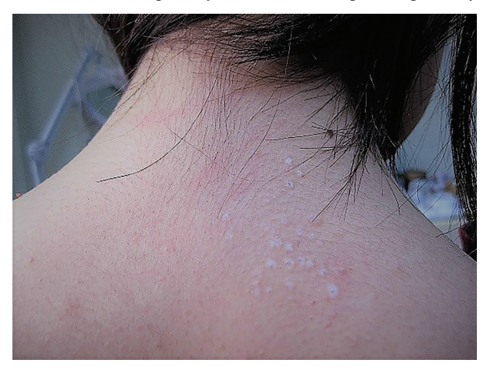
Figure 1. Numerous 2-8 mm perifollicular, hypopigmented, slightly atrophic papules on the upper back

LS is an inflammatory chronic dermatosis with anogenital and extragenital presentations<sup>4</sup>. It may occur in all ages with peak incidences in prepubertal and postmenopausal periods<sup>2,5</sup>. Up to 15% of LS cases are children, and it is generally localized on the anogenital region. Only