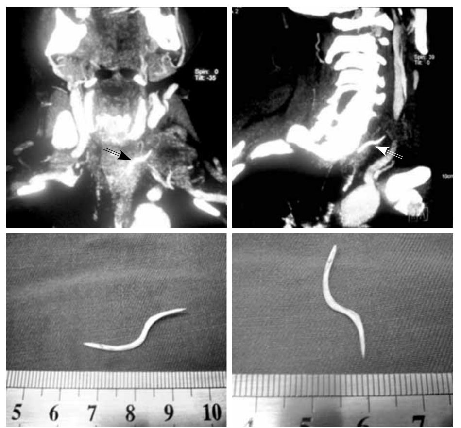
Fig 2. CT reveals granulation and fish bone in the base of the neck. The fish bone extracted during the operation is shown.

Compared to other esophageal diseases, esophageal perforation is a rare condition that can be difficult to diagnose and manage due to lack of experience.<sup>[6]</sup> Esophageal perforation can occur due to sharp or pointed foreign body ingestion.<sup>[9]</sup> Kay<sup>[10]</sup> reported a perforation rate of 15%~35%. In 149 patients from five recent series,<sup>[1,5,9,11,12]</sup> we found that cervical esophageal perforations were associated with a mortality of 5.9% (0%-20%), whereas thoracic perforations were associated with a mortality of 10.4% (0%-36.8%).