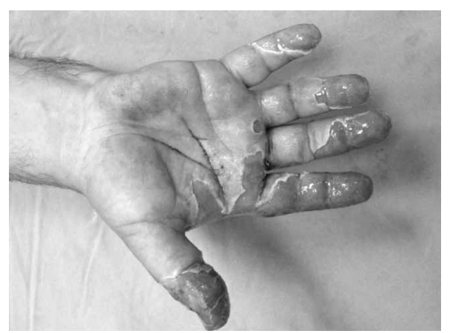
Fig. 1. Appearance of frostbite burn caused by freon gas.

had partial finger amputation. The hospital stay for treatment of their burns ranged from 16 to 52 days, with a mean stay of 30 days. Postoperatively, range of motion exercises were performed to prevent contractures. The follow-up period ranged from 3 to 16 months.