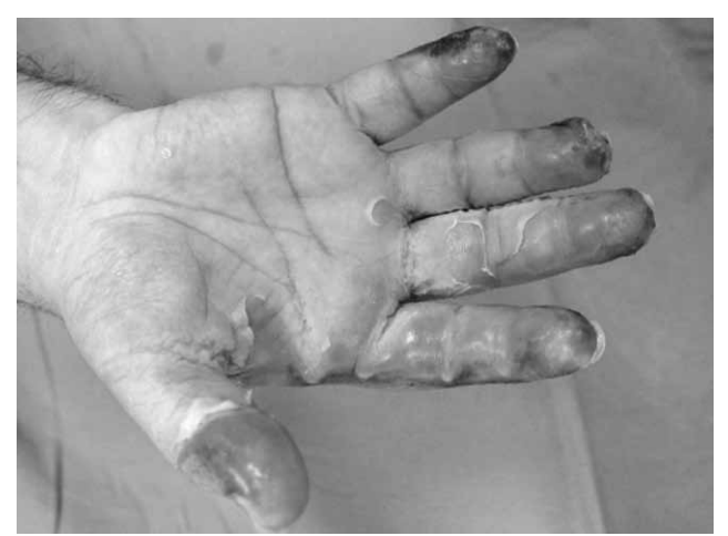
Fig. 2. Four days after the injury.

Case 16- A 29-year-old man admitted to our burn care unit with frostbite involving the right hand. Frostbite injury due to contact with LOx occurred while he