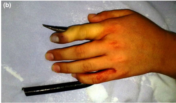
Figure 1. (a, b) Ischemia of the index finger after a spiked railing penetration through the second web space.