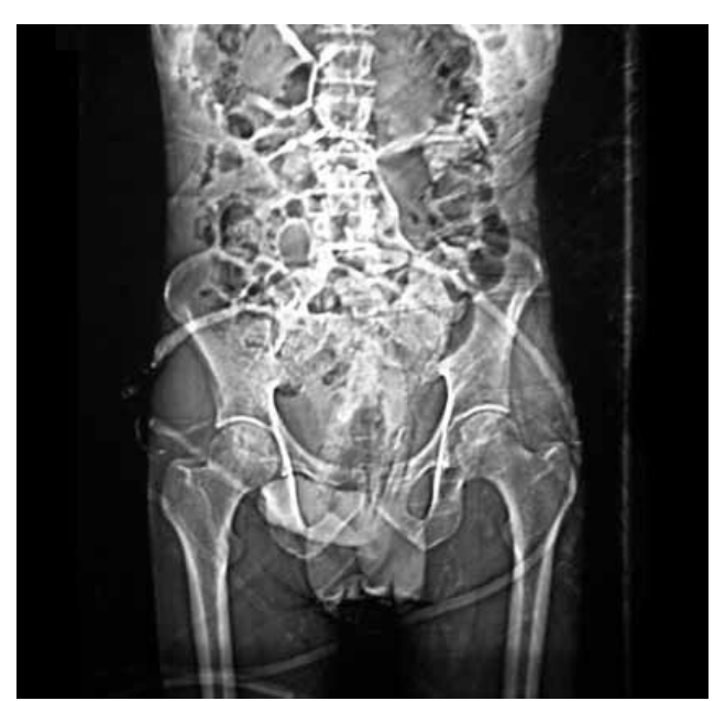
Fig. 1. Plain abdominal radiograph showing the dilated bowel loops and foreign body in the rectum.

tum two weeks before. A plain abdominal radiograph (Fig. 1) and abdominal computerized tomography (CT) scan (Fig. 2a, b) showed the bull horn impacted in the rectosigmoid region with proximally dilated bowel loops. There were no signs of perforation.