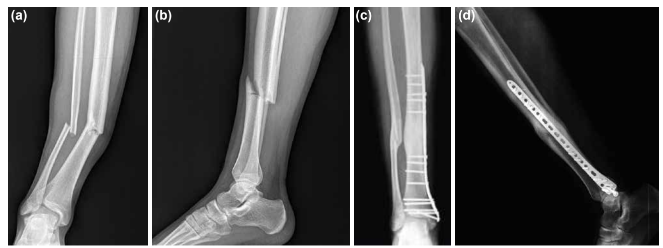
Figure 2. A 22 years old male was involved in a traffic accident sustained a closed right distal tibia fracture. The surgery was performed 9 days post-injury with MIPO technique. (a) Preoperative anteroposterior radiograph of the injuried tibia, (b) preoperative lateral radiograph of the injuried tibia (c) postoperative anteroposterior radiograph of the tibia at two years follow-up. Bony union was achieved. (d) Posopertative lateral radiograph of the tibia at two years follow-up.

bearing after bone union. Radiographic union was defined as the presence of callus in three of the four cortices as seen on antero-posterior and lateral radiographs. Radiographs were assessed by a trained reviewer not involved in the patients' care. Malunion was defined as more than five degrees of angular or rotational deformity. Delayed union was defined as lack of union at 24–26 weeks, and nonunion was defined as lack of healing at >9 months. Clinical evidence of infection (deep or superficial) was recorded. Deep infection was defined as below the muscular fascia. Superficial infection was confined to the dermal and subcutaneous tissue, and persistent drainage from the wound for at least two days.