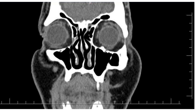
Figure 5. Maxillofacial CT left orbital bone graft postop. 6. months.

Permanent, post-operative, vertical diplopia in extreme gazes was detected in three of 14 patients in whom the or-