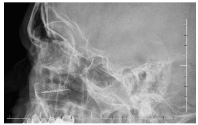
Figure 7. Radiographic image of the implanted titanium mesh.

bital floor was reconstructed with an iliac bone graft. However, since eye globe movements were free in all directions in all of the three patients, diplopia was considered to be the result of muscle contusion. Orbital floor evaluation via maxillofacial CT is seen in Figure 5. Hematoma requiring drainage was developed at the donor area in two patients also in this group. All patients in whom iliac bone graft was used complained about severe pain at the donor area. None of the patients developed an infection or experienced implant extrusion.