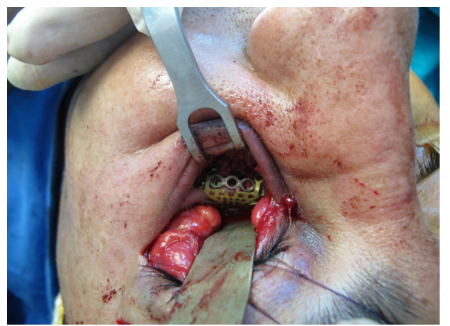
Figure 4. The titanium mesh placed to the orbital floor defect.

mesh implants were fixed to the lower orbital rim using two micro screws (Fig. 4). Shapes of all autologous and alloplastic implants were modified to fit the defect and orbital floor. After placement of the implant, eye globe movements were tested with the forced duction test. After determining that eye globe movements in all directions become unrestricted, canthopexy was performed to prevent post-operative lower eyelid retraction, and then the incision was closed with double layers of 5/0 polyglactin suture. Reduction and plaque-screw fixations of all fractures of other maxillofacial bones accompanying the orbital floor fracture were performed simultaneously with the orbital floor fracture reconstruction.