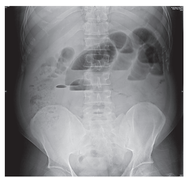
Fig. 1. Plain film shows multiple loops of dilated small bowel and air-fluid levels.

decided and midline laparotomy was performed. During the exploration, a fibrotic band was identified between the antimesenteric border of the terminal ileum and the posterior wall of the umbilicus, causing small bowel volvulus (Fig. 2a). The band was resected without any bowel resection (Fig. 2b). The postoperative period was uneventful and the patient was discharged on the 6th day with full recovery. The pathologic evaluation was reported as fibrous tissue.