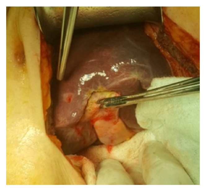
Figure 4. Perioperative image of a patient who underwent interval cholecystectomy showing the fibrosis around the gallbladder developed following percutaneous cholecystostomy.

Although the Tokyo Guideline, which had been developed for classifying the severity of cholecystitis patients and was updated in 2013, is a guide for determining the treatment modality in patients with cholecystitis, grade II acute cholecystitis defined in the guideline has a broad spectrum. It can