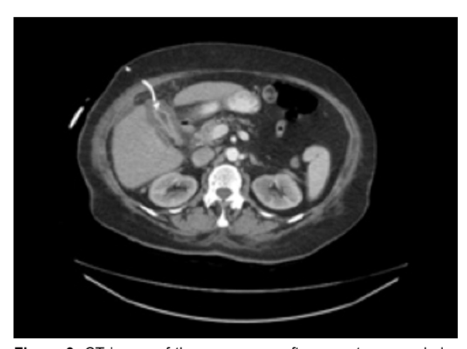
Figure 3. CT image of the same case after percutaneous cholecystostomy.