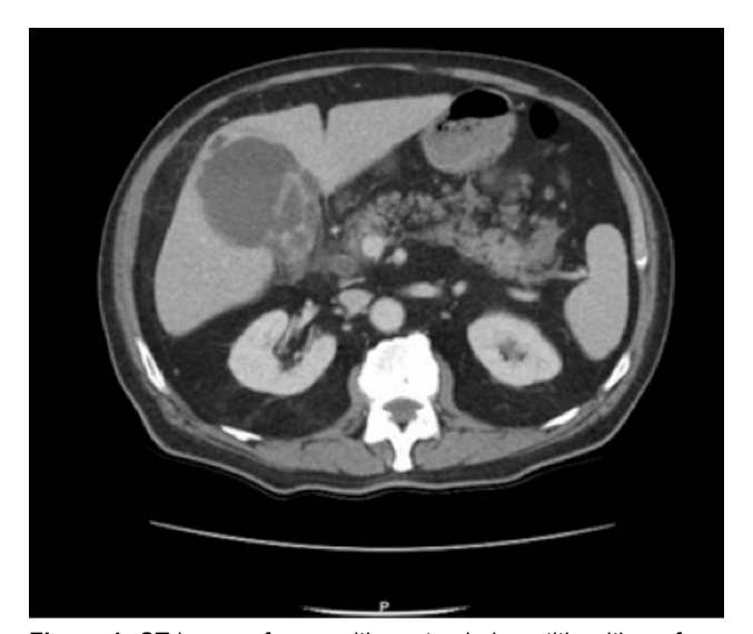
Figure 1. CT image of case with acute cholecystitis with perforation into the gallbladder bed.

Percutaneous cholecystostomy was performed in this patient group, considering that cholecystostomy might reduce both the inflammation and the risk of bile duct injury by postpon-