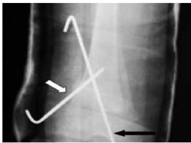
Fig. 1. Direct X-ray illustrating the anatomic correlation between the popliteal artery and the K-wires (arrowheads).

extremity vascular injury in rarely related to iatrogenic factors. [2,3] Lower extremity arterial injury accounts for 30% of the reported pediatric vascular trauma cases. [1]