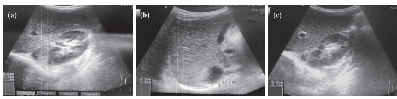
Fig. 2. US examination (a) 3 and (b) 10 days and (c) 1.5 months after the accident revealed a phased decrease in the hematoma size.

Adrenal gland hematomas, which are more common in children than adults, are associated with an-