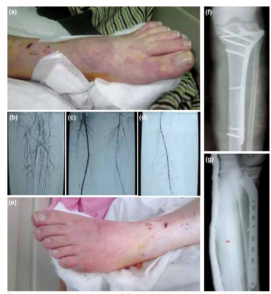
Figure 2. (a) Ischemic changes in the left foot. (b-d) Angiograph showing widespread arterial vasospasm in the left lower extremity. (e) The left foot after treatment. (f, g) Fixation of the tibial plateau fracture.

Fractured hip dislocations and tibial plateau fractures are often associated with severe soft tissue damage, and open fractures occur in many cases.<sup>[13]</sup> As the injuries arise from highenergy trauma, there is a high risk of vascular nerve damage