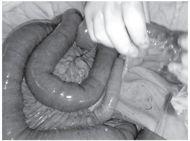
Fig. 3. Reduced small bowel with dilated proximal end with impending gangrene and narrowed distal end.

for its use in SBO has not been fully developed. Moreover, CT may not be a practical screening tool for all patients with non-specific abdominal pain or vomiting.<sup>[7,8]</sup> USG is a versatile tool that can be performed at the bedside in the emergency department. Although abundant gas may prevent satisfactory examination of the abdomen, using fluid filled bowel loops as an acoustic window or performing a meticulous examination through the flank may show the presence, level and cause of SBO. However, less than 20% of underlying etiologies of SBO can definitively be recognized with this method.<sup>[5]</sup> In our case, we could not do CT scan of the abdomen, and color Doppler was not considered because the patient was in full blown dynamic intestinal obstruction with features of impending small bowel gangrene, and was taken for emergency laparotomy. USG, however, was not helpful in delineating the cause of SBO. Laparoscopic transabdominal extra-