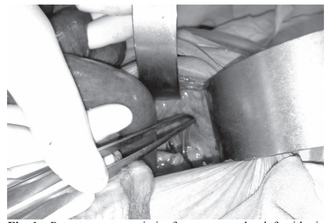
Fig. 1. Patent greater sciatic foramen on the left side is shown with the help of forceps, after an exploratory laparotomy was done.