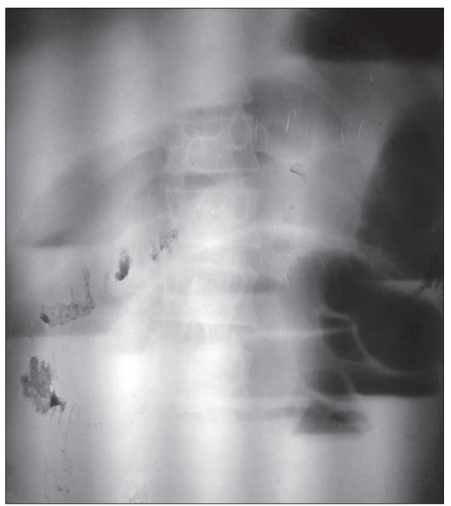
Fig. 3. Case 2 - Erect abdominal radiograph showing multiple air-fluid levels predominantly in the central abdomen and to the left.

three days' duration. There was no history of a previous similar pain or of previous surgery. The abdomen was distended, with tenderness and guarding throughout. Total leukocyte count was 19,600/cmm. Renal function tests were normal. USG of the abdomen revealed hyperperistaltic dilated small bowel loops with a small amount of free fluid in the abdomen. Plain X-ray of the abdomen revealed multiple air-fluid levels (Fig. 3). Exploratory laparotomy was planned. Intra-operatively, the Meckel's diverticulum with gangrenous base was found attached to mesentery by its distal end, thus forming a loop (Fig. 4). A segment of the terminal ileum was compressed in this