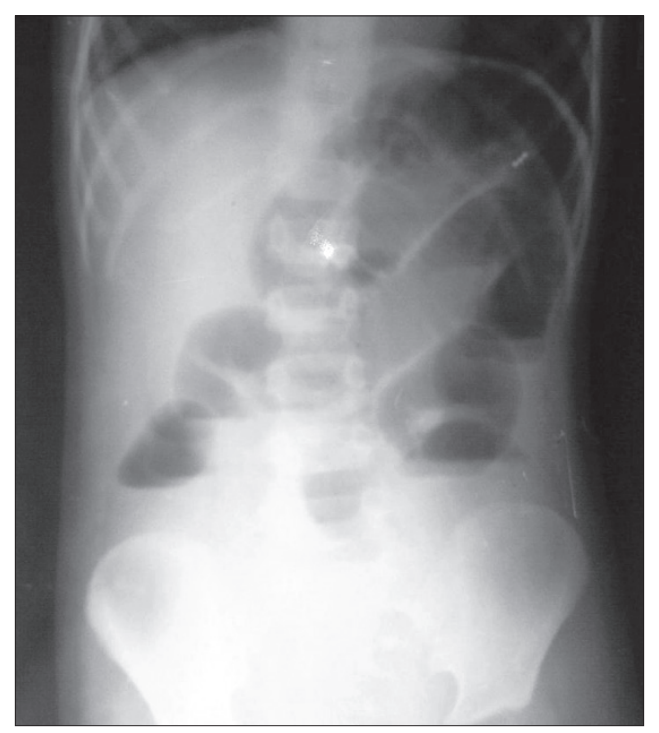
Fig. 1. Case 1 - Erect abdominal radiograph showing multiple air-fluid levels predominantly in the central abdomen and to the left.

three days' duration. There was no history of a previous similar pain or of previous surgery. The abdomen was distended, with tenderness and guarding throughout. Total leukocyte count was 19,600/cmm. Renal function tests were normal. USG of the abdomen revealed hyperperistaltic dilated small bowel loops with a small amount of free fluid in the abdomen. Plain X-ray of the abdomen revealed multiple air-fluid levels (Fig. 3). Exploratory laparotomy was planned. Intra-operatively, the Meckel's diverticulum with gangrenous base was found attached to mesentery by its distal end, thus forming a loop (Fig. 4). A segment of the terminal ileum was compressed in this