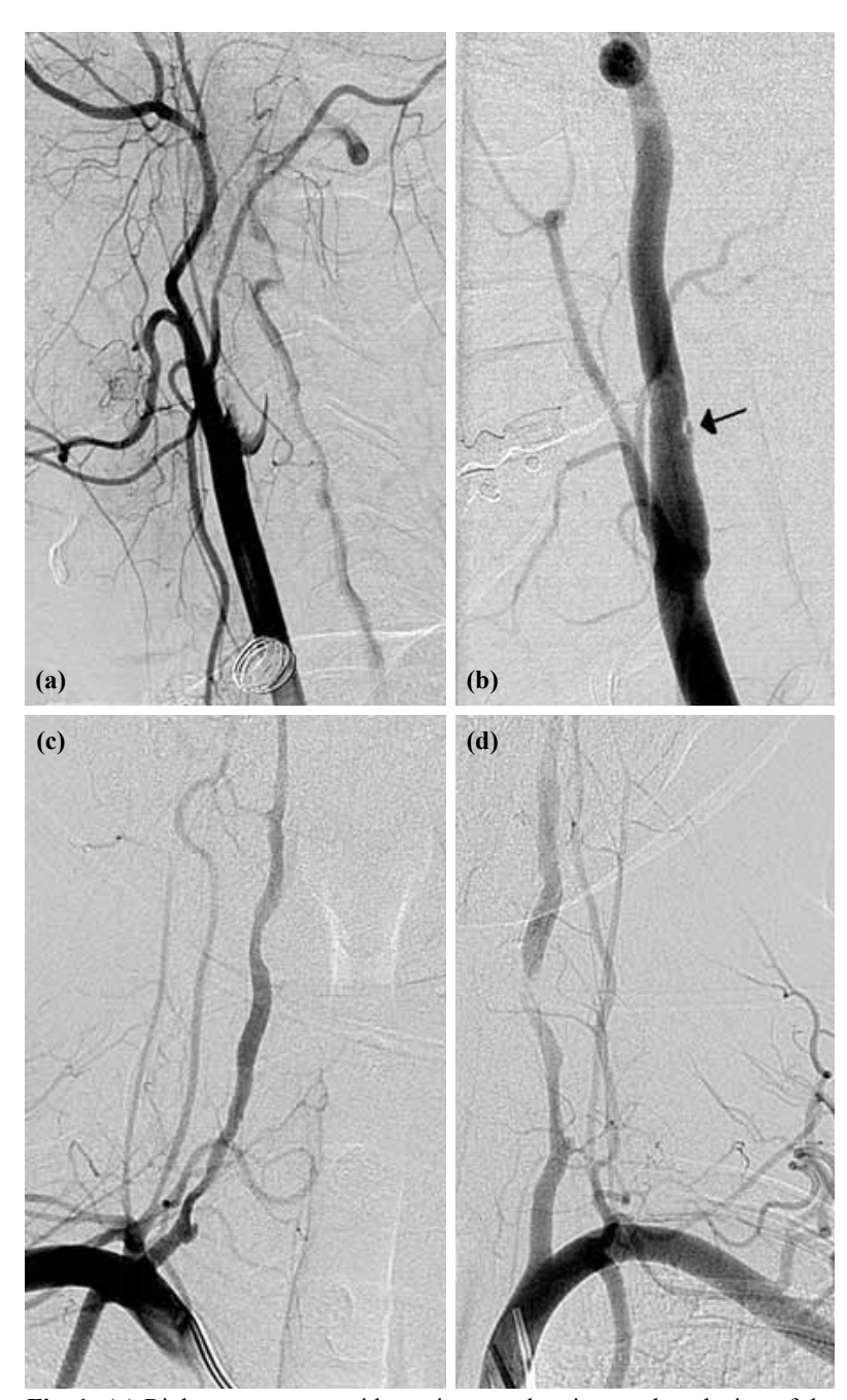
Fig. 1. (a) Right common carotid arteriogram showing total occlusion of the internal carotid artery at its origin. (b) Left common carotid arteriogram demonstrates a small dissection flap (arrow) on the posterior wall of the internal carotid artery. (c) Right subclavian arteriogram shows dissection flap and a small pseudoaneurysm at approximately the C7-T1 level; distal cervical vertebral artery is involved to a lesser extent. (d) Left subclavian artery shows a similar involvement of the vertebral artery on the right side.

son.<sup>[19]</sup> Trauma and connective tissue disorders represent the major risk factors.<sup>[20]</sup> Most cervical dissections are atraumatic or associated with only mild trauma.<sup>[3]</sup> Traumas due to roller coaster rides have been rarely associated with cervical arterial dissections. There have been five cases of vertebral artery dissection and seven cases of internal carotid artery dissection