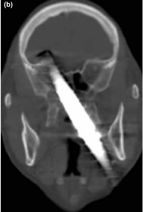
Figure 2. (a) A 3-dimensional computed tomography scan showing the trajectory of the steel bar. (b) A coronal view of the brain computed tomography scan showing the steel bar penetrating to the base of the right frontal bone.