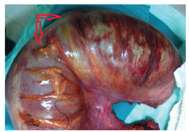
Figure 3. Intra-operative pictures of a bowel microperforation (indicated by the arrow).