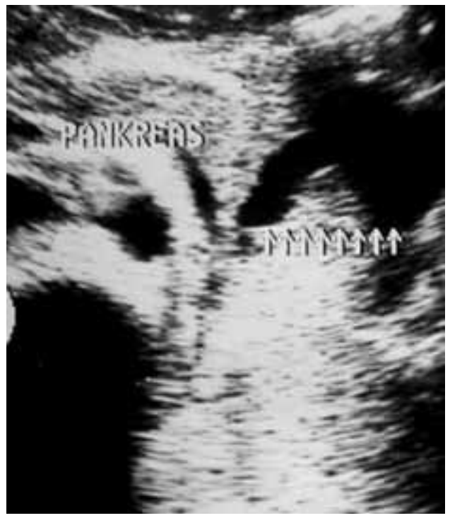
Fig. 2. A transverse plane US image of the pancreas demonstrates a linear fluid with full transection of the pancreas between the body and tail (arrows).

Computed tomography is the most effective imaging modality for the diagnosis of pancreatic injuries, but a high index of suspicion is required.<sup>[6]</sup> The sensitivity of CT for detecting pancreatic injuries ranges from 33 to 100%.<sup>[8-10]</sup> The spectrum of CT findings includes subtle edema or fluid in the peripancreatic fat, focal or diffuse pancreatic enlargement, irregularity of the pancreatic contour,