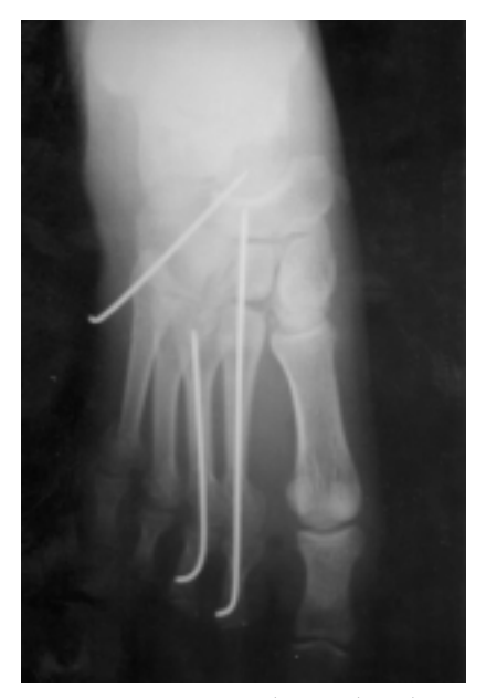
Picture 2a. Postoperative radiographs show anatomic reduction of the Lisfranc's joint and fixation with smooth K-wires.

open reduction and retrograde intramedullar fixation was performed with smooth K-wires for the second and third metatarsal neck fractures. In order to maintain the stabilization of the Lisfranc's joint, the K-wire in the second metatarsal was advanced to the middle cuneiform and navicular bones. Another smooth K-wire was placed percutaneously from the base of the fifth metatarsal through the cuboid bone under fluoroscopic control (Picture 2).