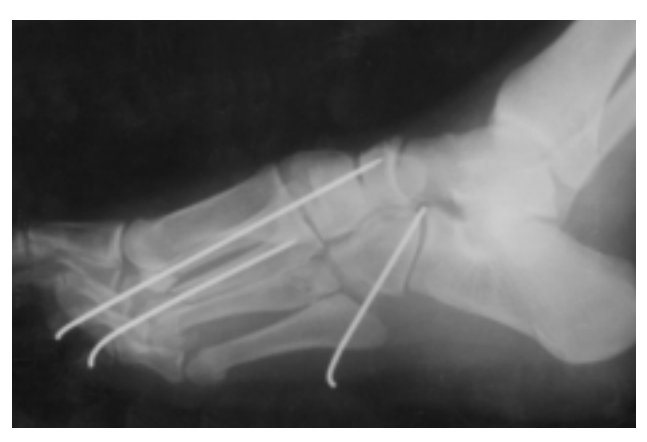
Picture 2b. Postoperative radiographs show anatomic reduction of the Lisfranc's joint and fixation with smooth K-wires.

Postoperative management of the patient was made with a below knee walking-cast and partial