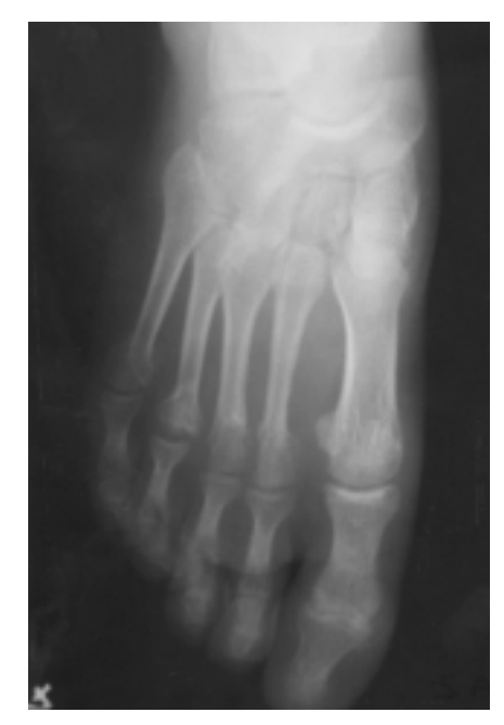
Picture 3a. Radiographs taken nine months later show maintenance of reduction

weight-bearing was permited.. Cast and K-wires were removed at the end of the sixth week, and full weight-bearing was permited. At the last follow-up visit, at the end of the ninth month, range of motion of the ankle and foot was full, with no pain on daily activities. Radiographs taken implied that there was no redisplacement (Picture 3).