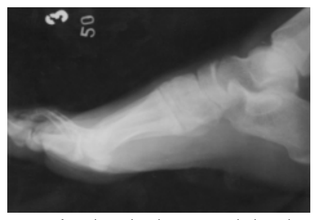
Picture 3b. Radiographs taken nine months later show maintainance of reduction

tarsometatarsal joints displace in one direction; partial, in which only first tarsometatarsal joint displaces medially (partial-medial) or lateral four joints displace laterally (partial-lateral) in one direction; and divergent, in which first tarsometatarsal joint displaces medially and lateral four joints displace laterally.<sup>9</sup>