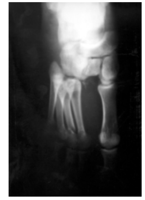
Picture 1a. Preoperative radiographs show partial-lateral dislocation of the Lisfranc's joint, fracture of the necks of the two through five metatarsals, dorsal dislocation of the bases of the two through four metatarsals.

On the day of injury, in the operating room, under general anesthesia fluoroscopic evaluation of the foot was performed. In addition to above findings there was a fracture at the base of the fourth metatarsal. Dislocation was succesfully reduced with closed manual manipulation and fluoroscopic evaluation was repeated. Alignment of the second and third metatarsal neck fractures was insufficient. Through a dorsal longitudinal incision in the second distal intermetatarsal space,