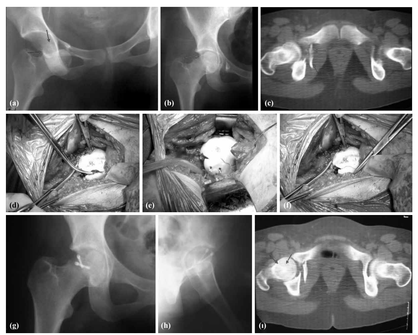
Fig. 3. This 20-year-old female patient had fracture dislocation of the hip joint. She had both acetabular fracture and fracture of the femoral head (Pipkin type IV). (a) The initial X-ray of the patient before the reduction of the hip joint. After reduction, we observed displaced femoral head fracture (b, c). Figs. (d-f) are intraoperative photographs of the patient. The fracture, reduction and fixation with two countersunk screws are seen. Figure (g) and (h) are postoperative X-rays of the patient. The anatomic reduction and fixation of the fragment can be seen. Postoperative CT also supports the quality of fixation (i).

Femoral head fractures are serious injuries. They are commonly seen after high-energy trauma following traumatic hip dislocation. Femoral head fracture dislocations are one of the few orthopedic emergen-