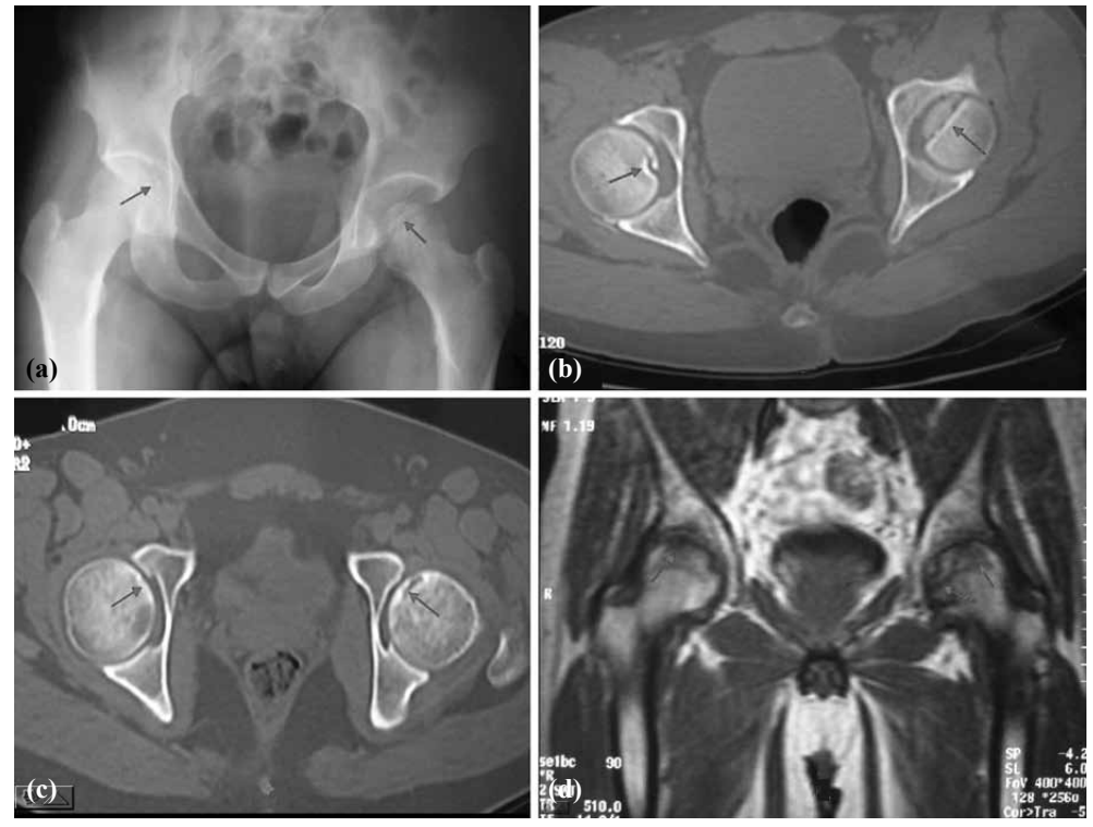
Fig. 1. This 21-year-old male patient was treated conservatively. Preoperative X-ray (a) and CT (b) of the patient showed the fractures on both sides (arrows). After one-year follow-up, we observed that the fractures were united (c); however, bilateral avascular necrosis of the femoral head was observed in the patient as seen in MRI (d). This patient had poor functional outcome.

Five patients with six femoral head fractures were treated in our hospital between March 2006 and December 2007. Three of the fractures were stable with minimum displacement; therefore, they were treated nonoperatively (Figs. 1, 2), while three of them were treated with open reduction and internal fixation (ORIF) (Fig. 3). The average age at the time of injury was 28 (20-36) years. Most of the fractures were due to traffic accident; only one patient sustained injury from a motor vehicle accident. The fractures were classified and are summarized in Table 1 according to AO, Brumback and Pipkin classifications. All femo-