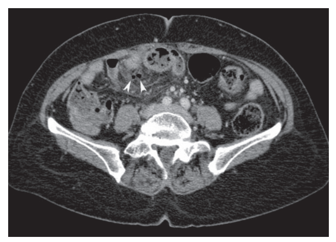
Fig. 2. A localized pneumoperitoneum (arrowhead) surrounded by inflammatory mesenteric fat (white arrow) is also found in the vicinity of the ileal segment.

Perforation of the GI tract by ingested FBs is uncommon, and less than 1% of ingested FBs perforate the bowel.<sup>[4,5]</sup> Those that cause perforation are usually either sharp, pointed or elongated.<sup>[4]</sup> They are usually fish bones, toothpicks and chicken bones. FB perforation occurs in all segments of the GI tract, although it tends to occur in regions of acute angulation, such as the ileocecal and rectosigmoid junctions.<sup>[2,6]</sup> FBs may also perforate through a hernia sac, Meckel's diverticulum, or the appendix.<sup>[7]</sup> FB perforation of the GI tract has a wide spectrum of clinical presentations, which can be acute or chronic. Patients occasionally present with unusual or even bizarre clinical manifestations, including hemorrhage, bowel obstruction, and even ureteric colic.<sup>[2,7]</sup> With these varied and nonspecific