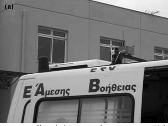
Fig. 1. Traffic priority system for emergency vehicles.(a) Mobile unit placed on the emergency vehicle.(b) Immobile unit positioned on the traffic light.

The GPS is a world range system, developed by the United States (US) Department of Defense, and is based on an array of 24 satellites at an altitude of 11,000 nautical miles with a rotation period around the earth of 12 hours on six orbital levels, as well as on their ground stations. This satellite constellation accomplishes at any period of time, under any weather conditions, location and navigation of an unlimited number of users.<sup>[7,8]</sup> GPS accuracy is affected by a