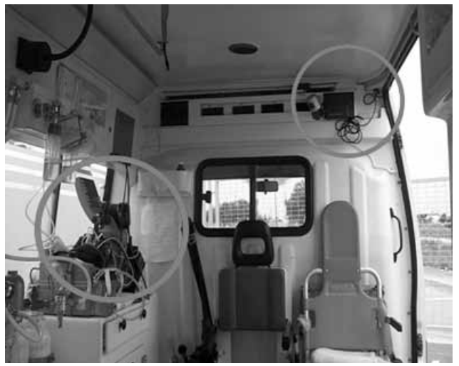
Fig. 2. Emergency vehicle cabin after installation of the electronic devices.

These vehicles were also staffed with specially trained crews. It should be mentioned that during the study, the ambulance drivers always drove in accordance with the traffic regulations and respected to the letter the speed limits both within and without the city boundaries.