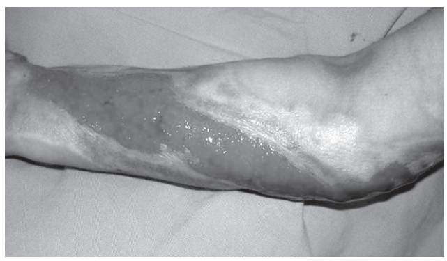
Fig. 1. Preoperative view of the defect in a case with burns of the upper extremity.

mental cases revealed that congenital infections or teratogens may be the etiologic cause. Down syndrome was confirmed by the medical reports submitted by the family. Patients with Down syndrome ranged in age between 3 to 6 years; unfortunately, IQ scores were not obtained in these cases. The rest of the mental retardation cases were over 6 years old, with an IQ level of 70-75.