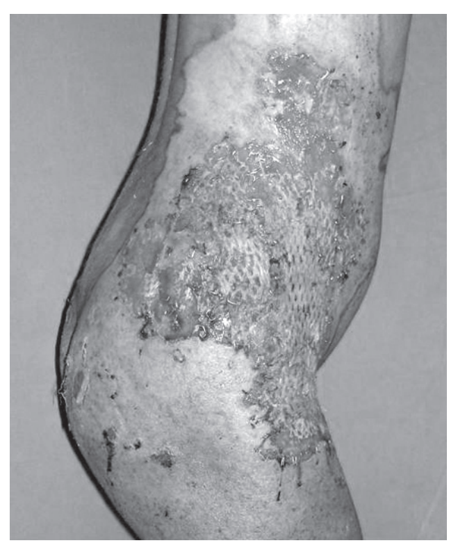
Fig. 3. View of a case with partial graft loss caused by hyperactivity.

The management of geriatric burn victims is also a major challenge. In this study, we included six senior patients who were \geq 65 years old with pre-existing conditions. The pre-burn functional status and premorbid conditions of these geriatric patients are useful tools for developing an interdisciplinary treatment protocol. The premorbid geriatric burn victims have a higher mortality rate than geriatric patients.<sup>[6]</sup> In deciding burn treatment, we also needed to focus on the associated pathophysiological conditions. Six of our patients were in the geriatric age range; of these, three