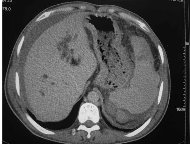
Fig. 1. Abdominal CT - Grade II splenic trauma.

Most of the patients who suffered blunt splenic trauma were young males less than 30 years of age (70%). Of the 67 patients who underwent CT scan, 21 had grade I injury, 13 had grade II (Fig. 1), 16 had grade III, 14 had grade IV (Fig. 2), and 3 had grade V (Figs. 3 and 4). All patients with grade I injury and 12 of 13 patients with grade II injury were managed non-