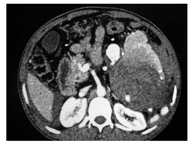
Fig. 3. Abdominal CT - Grade V splenic trauma.

Twelve patients in the splenectomy group and 7 patients in the non-operative group had associated injuries. Bilateral hemothorax in 5 and left hemothorax in 14 patients was managed with intercostal tube drainage alone. Four of 5 patients with bilateral hemothorax had associated multiple rib fractures, which required no surgical intervention apart from intercostal tube drainage. Four patients had mild head injury and 2 had moderate head injury managed with non-operative approach alone. Seven patients had associated liver injury (grade I-III) managed non-operatively. Six patients had associated long bone fracture managed with external fixation in 3 left humerus fractures and with internal fixation in 3 left femur fractures.