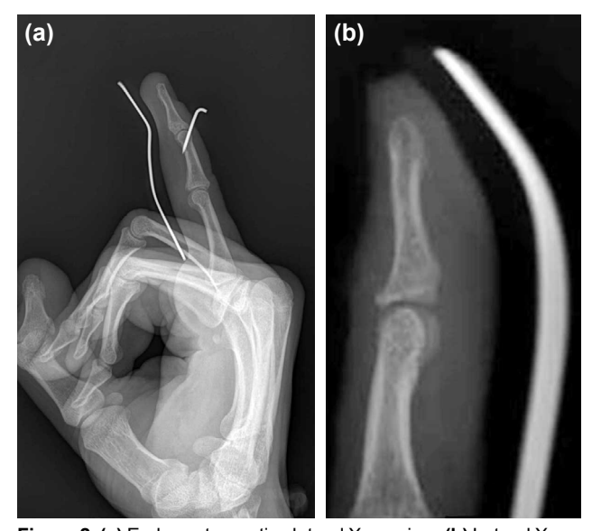
Figure 2. (a) Early postoperative lateral X-ray view. (b) Lateral X-ray view after week 6, before the aluminum orthotic splint was removed.

Clinical and radiographic evaluations were conducted in all cases. Fracture union was defined as the X-ray presence of bridging trabeculae and a radiolucent line at the fracture gap and the clinical absence of tenderness at the fracture site. Complications and progress with bony union were evaluated with clinical examinations and weekly radiographs. The active range of motion and extension lag of the DIP joint was measured with a goniometer. Full flexion was considered to be achieved when the angle of the injured side reached that of the opposite side at follow-up. Functional outcomes were evaluated using Crawford's criteria (Table 2).<sup>[17]</sup>