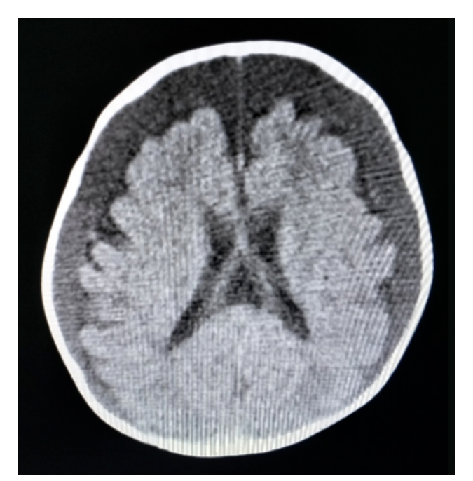
Figure 1. Computed tomography showing bilateral fronto-parietal-temporal chronic subdural haemorrhage.

of the left fundus was obscured by the vitreous haemorrhage. Six weeks later, an examination under anaesthesia (EUA) was performed. The vitreous haemorrhage cleared up, but there