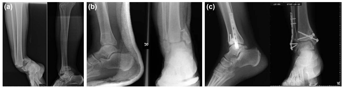
Figure 1. Ankle fracture with dislocation for Weber A or SAD: (a) preoperative grafy, (b) preoperative graphy after reduction, (c) postoperative grafy on the 6<sup>th</sup> month.