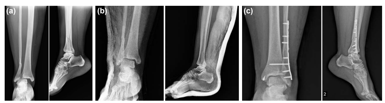
Figure 3. Ankle fracture with dislocation for Weber C or PER: (a) preoperative grafy, (b) preoperative grafy after reduction, (c) postoperative grafy on the 6<sup>th</sup> month.