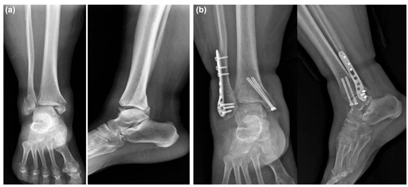
Figure 2. Ankle fracture with dislocation for Weber B or SER: (a) preoperative grafy, (b) postoperative grafy on the 6th month.