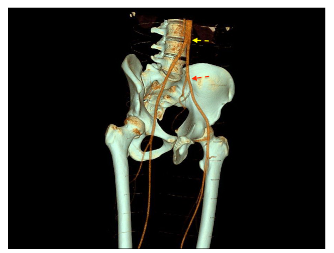
Figure 1. A 22-year-old man; volume-rendered 3D reconstruction image clearly depicts the distal abdominal aorta and both iliac artery. This oblique sagittal image demonstrates AB at the L4 VB level (yellow arrow) and CIAB at the L5-S1 IDL (red arrow).

and 4.7% abdominal aorta.<sup>[3]</sup> When we review the literature, it is seen that external iliac artery is injured in endovascular interventions,<sup>[4]</sup> whereas LCIA/V injury and at the level of L4-5 is more frequent in lumbar disc surgery.<sup>[5,6]</sup> In this study, morphometric analysis of vascular structures likely to be injured in CT angiography was performed by considering lumbar disc surgery associated vascular injuries.