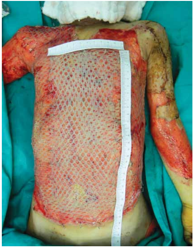
Figure 3. Allografts were placed over the autograft in the same manner.

graft area was measured and recorded as an expanded autograft area. Allografts were placed over the autograft in the same manner, and the meshed allograft area was measured and recorded as an expanded allograft area (Fig. 3). Autoallografts were covered with Bactigras<sup>®</sup>, and the first dressing change was made on the postoperative 3rd day. After the first dressing change, graft care was performed on a daily basis to monitor autograft take and allograft rejection.