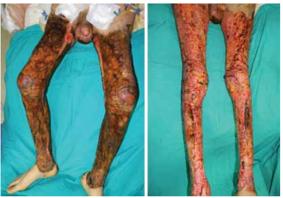
Figure 4. Appearance of the patient on the postoperative 8th day. The epithelialization between graft bridges was achieved.