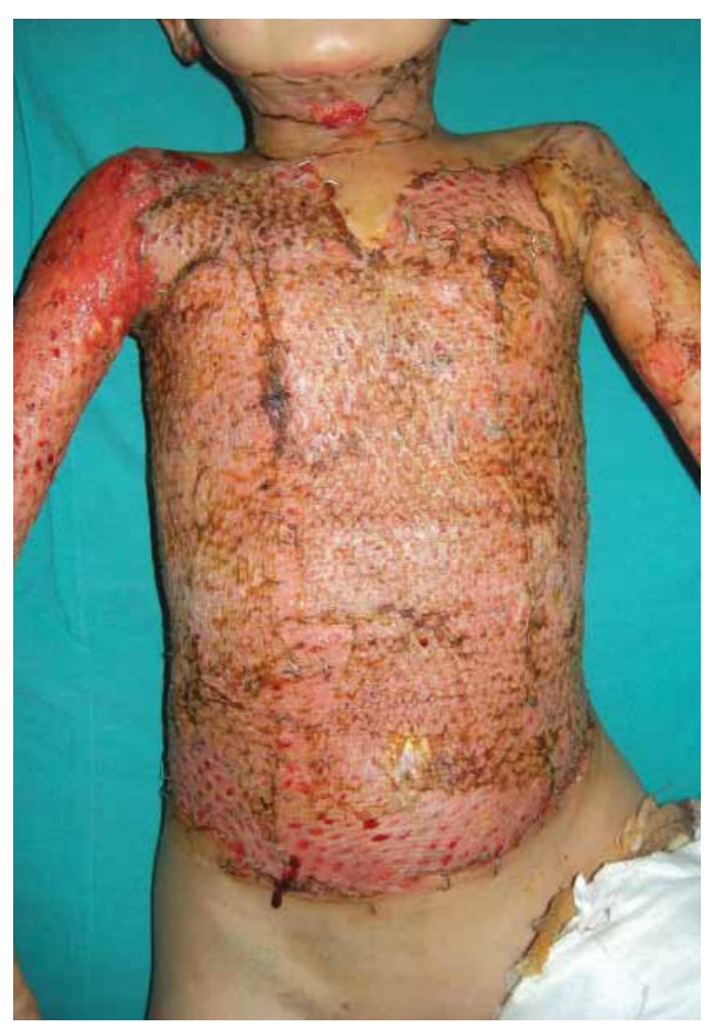
Figure 5. 84% flame+inhalation burn. The patient died on the postburn 34th day with intact auto-allograft (appearance of the autoallografts on the postoperative 10th day).

sults. However, we believe that both our results and their results are subjective because of non-standardized stretching of the graft. With a standardized stretching method, more predictable results could be obtained.