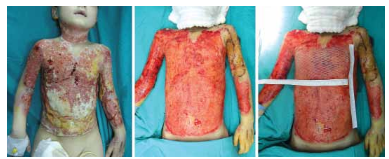
Figure 2. Preoperative appearance of the patient (left); after tangential excision of the necrotic and eschar tissue (middle), autografts were placed on the burn wound area.