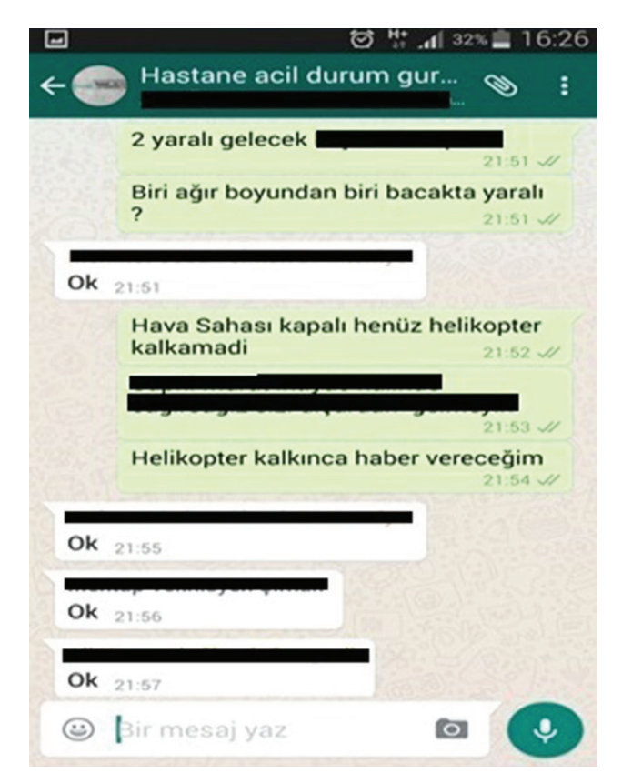
Figure 3. Sample of instant messaging application message.

A total of 510 emergency call messages pertaining to 17 combat injury emergency cases were logged. Of these, 221 were from doctors, 136 from nurses, and 153 from technicians. The messages were grouped according to response time, response time in different time periods, and the type of ET member (i.e., doctor, nurse, or technician).