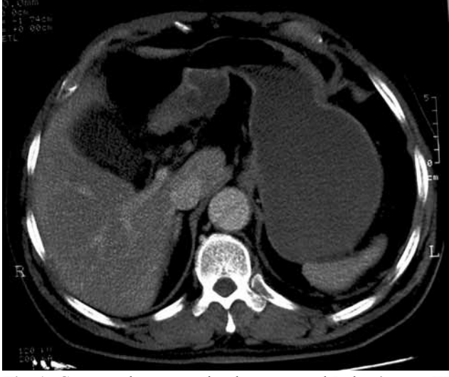
Fig. 1. Computed tomography demonstrated Bakey's type III aortic dissection.

Histological examination revealed that the gallbladder was completely necrotic. Acellular transmural severe necrosis was seen. The details of the cells could not be detected (Fig. 2).