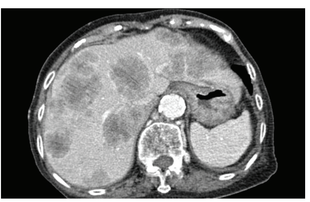
Figure 3. Three months follow up contrast enhanced MDCT scan of the abdomen demonstrates multiple hepatic metastases.

rare condition, being reported in only I of 365,520 hospital admissions.<sup>[2]</sup> The incidence of GB torsion increases with age and is more common in elderly women, with a male to female ratio of 1:3.<sup>[1,3]</sup> GB torsion occurs when it rotates along the long axis of the cystic artery and cystic duct. Predisposing factors for this rotation are either short/absent mesentery or long mesentery resulting in a free floating gallbladder. Other