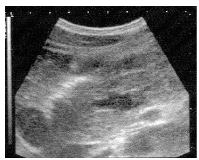
Fig. 2. Nonhomogeneous depiction of pancreatic echotexture - obliteration of the pancreatic fat.

especially of the liver, gallbladder, stomach and duodenum.<sup>[4]</sup> Isolated pancreatic-duodenal injury is less likely to accompany injury of the kidney.<sup>[6]</sup> Renal injuries accompanying injury of the pancreas resulting from blunt abdominal trauma are rare and have been estimated to occur in only 2.25% of the cases. While renal injuries are easily detectable in both clinical and radiographic imaging examination, pancreatic injuries are difficult to diagnose clinically and in several cases remain occult.<sup>[7]</sup> Symptoms and clinical signs are often non-specific and unreliable. while laboratory examination may be falsely negative. Indeed, amylase and lipase levels in diagnostic peritoneal lavage samples are often negative,<sup>[8]</sup> while the classic triad of fever, leukocytosis and elevation of serum amylase levels is rarely encountered.<sup>[9]</sup> Occasionally, the pancreas may have almost normal