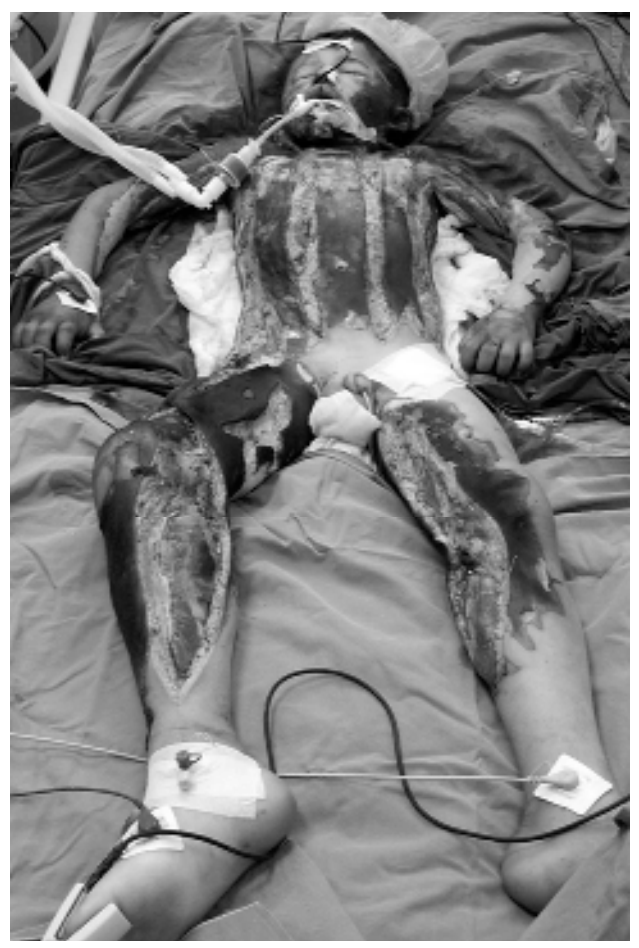
Fig. 1. Appearance of the patient early after his admission to SICU (Surgical Intensive Care Unit).

energy requirement as 70 kcal.kg-1. Patient failed to tolerate enteral feeding for several times. We could begin enteral feeding on 28th day. Total parenteral nutrition (TPN) was started with 6% trophamine, 10% dextrose and trace elements. In following days, 10% intralipid was added to TPN and 10% dextrose was replaced with 20% dextrose. Whilst TPN was maintained, diarrhea occurred and lasted 20 days. Tracheostomy needed to be performed on the fourth day due to severe edema. A temporary rectal tube was used for prevention of infection in the perianal region due to feces contamination. Various metabolic and hematological problems were seen such as severe anemia and thrombocytopenia, hyperglycemia, hypokalemia, metabolic acidosis, hypo/hypernatremia and hyperbilirubinemia. All of these particular disorders were managed accordingly. Erythrocyte suspension, Fresh Frozen Plasma and vitamin K were