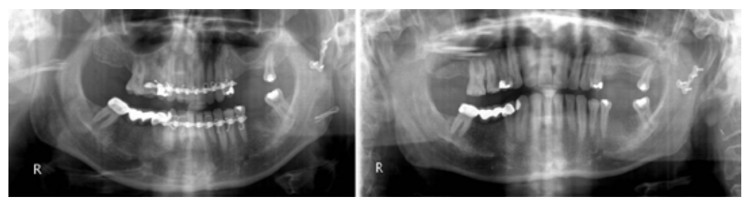
Figure 5. Postoperative early (with arch-bars) and late orthopantomogram images of the above patient.