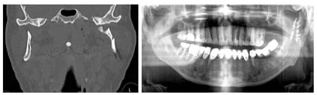
Figure 6. Case example. Left subcondylar fracture was fixed with two miniplates.

After surgery, a four week liquid diet was recommended to the patients. The patients were discharged on first postoperative day and were asked to return for follow-up visits at the end of the first and fourth postoperative weeks and at the end of the third and sixth postoperative months. The patients with arch-bars returned for an additional follow-up at the end of the second postoperative week for the removal of the arch-bar. The patients were evaluated for excessive bleeding during the operation and for hematoma, infection, Frey's syndrome, salivary fistula, facial nerve damage, occlusion, fracture site stability, chronic pain in the fracture site, hypoesthesia of the ear, and temporomandibular (TME) joint movements in the postoperative period.