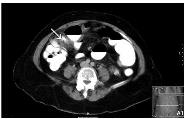
Fig. 1. CT image reveals concentric wall thickening and luminal narrowing in the cecum.

firm the diagnosis; however, a solitary giant cecal ulcer with vellowish exudate at the base and hyperemic deformed ileocecal valve were seen (Fig. 2). Multiple biopsies were taken for pathological diagnosis. On microscopic examination, active inflammation with eosinophil granulocytes and ulceration with fibrinopurulent exudate were noted (Fig. 3). Neither neoplastic cells nor cytomegalovirus (CMV) infection was established. A few fungus-like microorganisms were detected on examination with periodic acid-Schiff (PAS) dye. Carcinoembryonic antigen value was normal. On the 10th day of admission, physical findings remained stable with no change in the right lower quadrant mass and leukocyte count fell to normal levels. In fact, the reasonable suspicion of colonic neoplasia could not be excluded in the patient's management. Laparotomy was performed for a definitive diagnosis. On exploration, a cecal mass extending to the hepatic flexure was found with enlarged paracolic and mesenteric lymph nodes. Right hemicolectomy and ileocolic anastomosis were performed. Pathologic examination defined mucosal ulceration invading the muscularis propria and widespread congestion detected in the whole