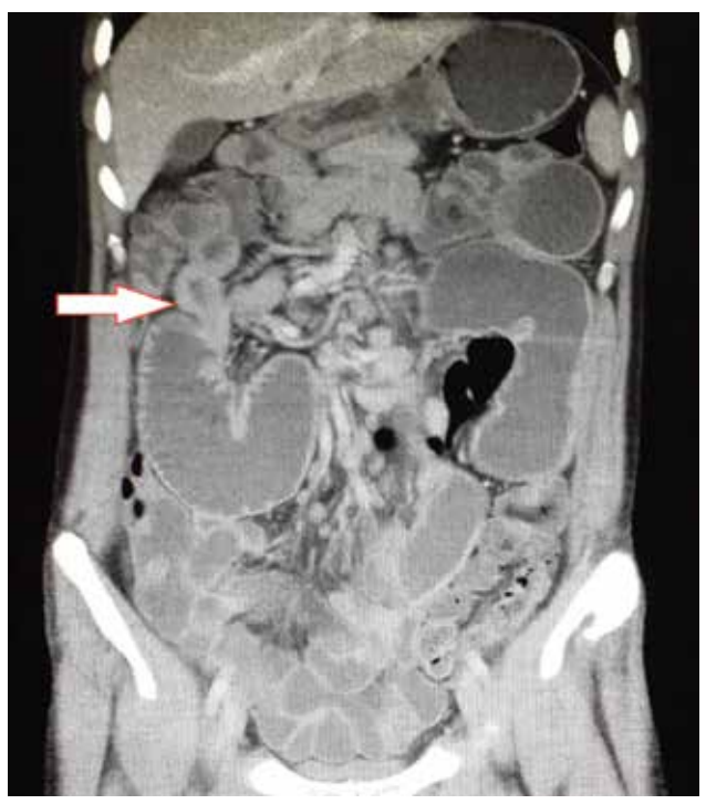
Figure 1. Abdominal tomography section with oral and intravenous contrast.

tation and edema in the proximal loop. It was also observed that distal crossing diameter was quite narrowed (Figure 2). The patient was discharged on post-operative day 8 without any problems. Pathological analysis demonstrated focal ulcerated area and active chronic nonspecific inflammation of the site (Figure 3).