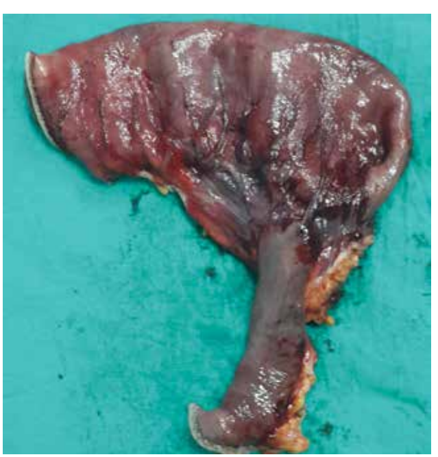
Figure 2. Image of the resected portion.

Although post-traumatic symptoms are frequently seen 5 weeks after the trauma, there are also reports present-