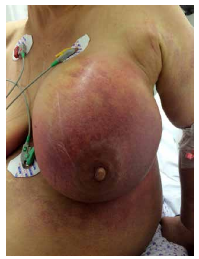
Figure 1. Markedly enlarged, ecchymosed, and tender breast due to hematoma.

increase, and color change. Bleeding can also spread to the chest wall. Red blood cell transfusion and surgery may be needed in such cases.<sup>[5]</sup>