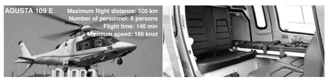
Figure 2. General outlook and technical characteristics of the ambulance helicopter used for transportation of patients with acute myocardial infarction for PCI

In accordance with the guidelines, air ambulance system may be more efficient if the patient is to be transferred from a hospital with the capability of performing thrombolytic therapy or PCI is preferred to thrombolytic therapy and the patient visits the hospital within three hours after the onset of chest pain and if the transportation time would be decreased up to one hour by the air ambulance (transportation time limit)