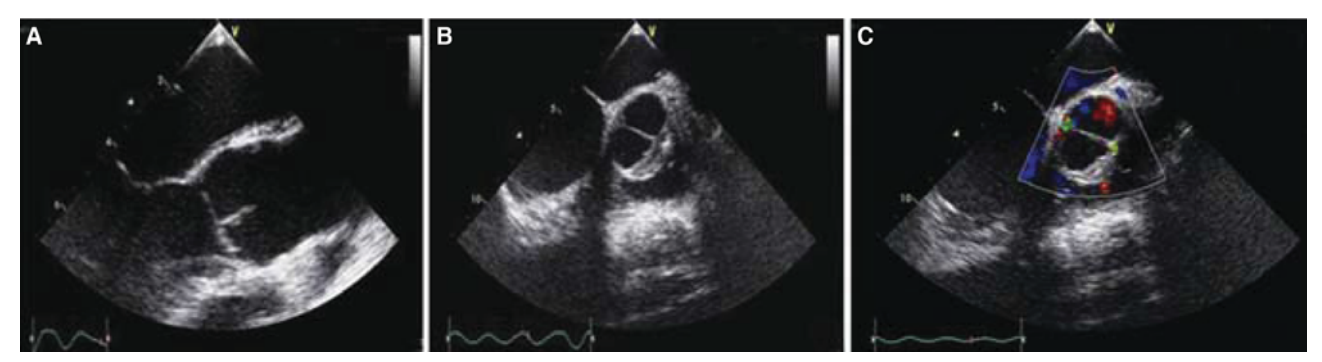
Figure 1. (A) Long axis image on the transesophageal echocardiography. (B) Image of quadricuspid valvular structure on transesophageal echocardiography. (C) Image of mild aortic insufficiency on color Doppler echocardiography.

med on the patient since the aortic valve could not accurately be assessed. The short-axis views revealed an aortic valve composed of two large cusps and two small cusps of equal sizes. Color Doppler scans also demonstrated aortic regurgitant flow at the coaptation sites of the small and large cusps (Figure 1).