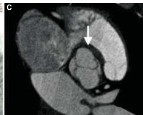
Figure 2. (A) Computed tomographic angiography image of the aorta. (B) Coronary artery and (C) quadricuspid valvular images on cardiac computed tomography.